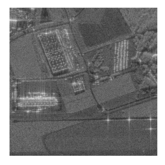
Fig. 2. Power representation image of the POLSAR dataset.

The POLSAR dataset was acquired by the ONERA RAMSES system in Brétigny, France. The acquisition was made in X-band, with a spatial resolution of 1.32m in range and 1.38m in azimuth. The resulting image is 501 \times 501 pixels. Fig.2 shows the power representation image of the dataset.